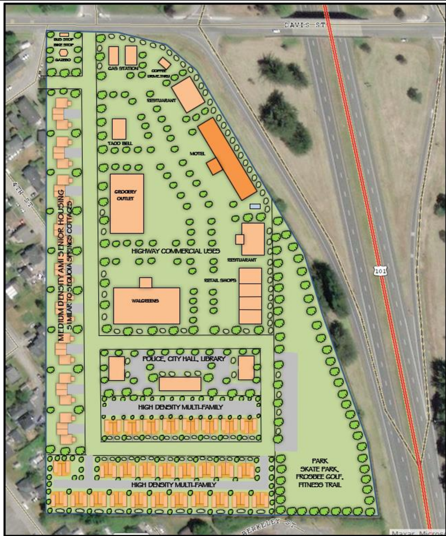
TODD PROPERTY CONCEPTUAL DEVELOPMENT (FOR ILLUSTRATION PURPOSES ONLY)